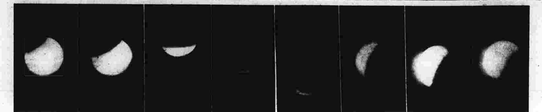
1:38 A.M. 1:54 A.M. 2:28 A.M. 2:32 A.M. 2:46 A.M. 4:17 A.M. 4:28 A.M. 4:50 A.M.

SAGINAW (AP) — A United Air Lines plane carrying 48 passengers and a crew of five was extensively damaged when it collided with a flock of geese Wednesday night between Saginaw and Flint.