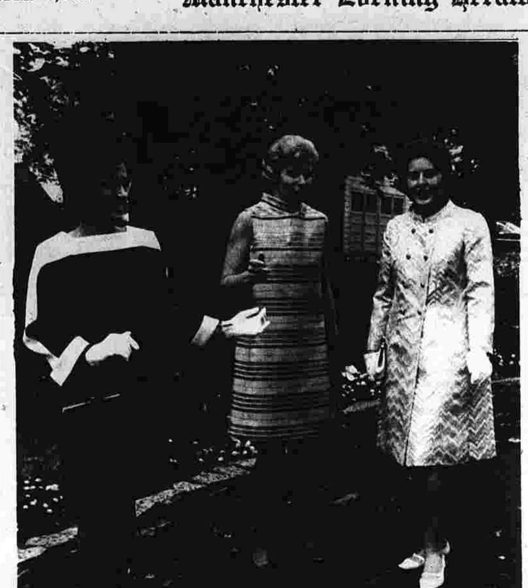
St. James' Ladies Have Fashion Show-Card Party Models in a Fashion Show-Card Party tomorrow at 8 p.m. at St. James' Hall, sponsored by the Ladies of St. James'.

Three recommendations for the relocation of the Charter Club Ski Club to the Town Recreation and Parks Advisory Committee last night.